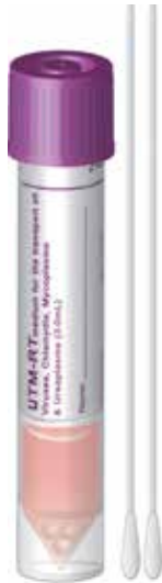
UTM-RT Transport (Purple-cap)