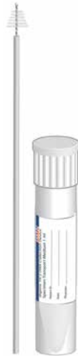
Digene Hybrid Capture® 2 HPV Collection and Transport Kit

Submit the Digene HPV transport tube containing specimen transport medium for the detection of low- and/or high-risk types of human papillomavirus (HPV) in cervical specimens by nucleic acid probe hybridization. Obtain specimen by first removing excess mucus from the cervical os and surrounding ectocervix using a cotton or polyester swab and then inserting the Digene cervical sampling brush 1.0-1.5 cm into the cervical os until the largest bristles touch the ectocervix. Do not insert brush completely into the cervical canal. Rotate brush 3 full turns in a counterclockwise direction, remove from the canal, and insert brush into the transport tube. Snap off shaft of sampler at scored line, leaving brush end inside tube, and recap securely by snapping in place. Transport at room temperature. Supply order number: 22495