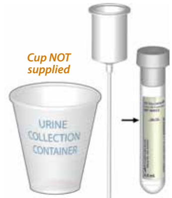
Vacutainer® Urine Culture Transport Tube