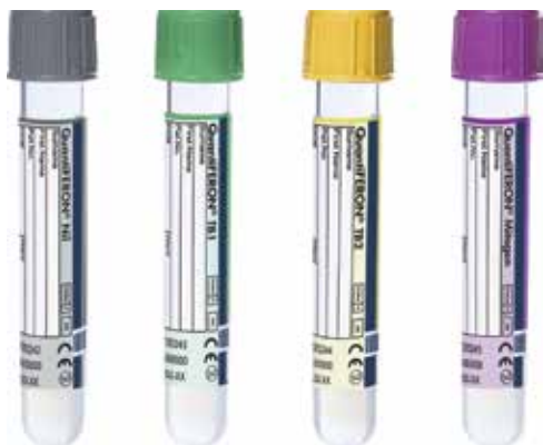
QuantiFERON®-TB Gold Plus (QFT®-Plus) Kit

Supply order number: 121725, 121727 (High Altitude)