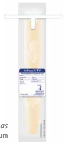
InPouch™ TV Trichomonas Transport and Culture Medium