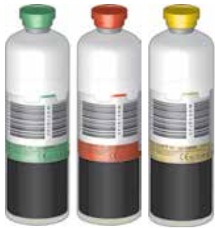
Aerobic, Anaerobic, and Pediatric BacT/Alert® Blood Culture Bottles