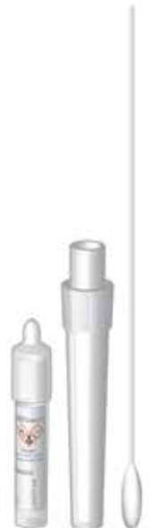
BD Affirm™ VPIII Ambient Temperature Transport System