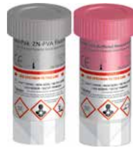
PVA and Formalin Vials